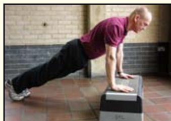
Declined Press Up